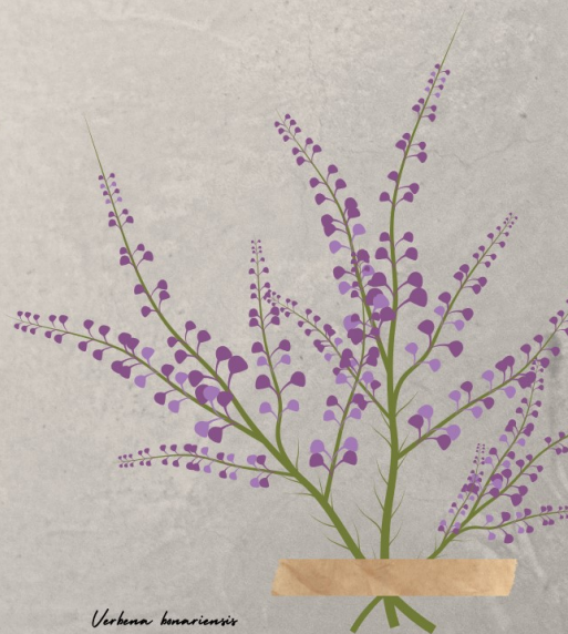
Verbena benariensis Keep on hand for protection